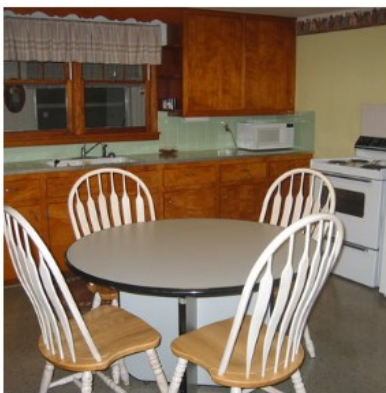
kitchen plus dining area