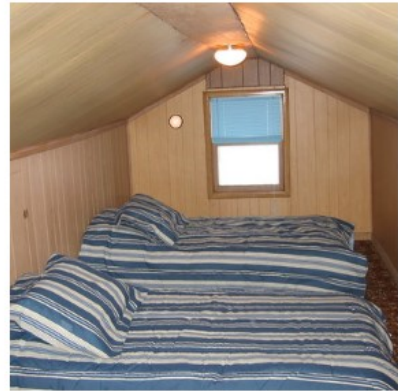
second level loft