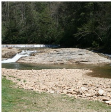
watering hole, upstream view